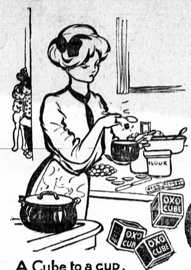
A Cube to a cup.

The new corset designed to corset over-fat ladies into the new style gowns has three sets of strings. When you have one set adjusted you still have two more strings left. Think of that—and shudder. To escape this fate, fat ladies should lose no time in securing one of the large cases of Marmola Prescription Tablets—these druggists and the Marmola Company, Detroit, Mich., sell for 75 cents. One of these tablets taken after each meal and at bedtime for a short while will make her independent of the new corset. Being made in strict accordance with the famous Marmola Prescription, these pleasant little standbys of the over-fat are perfectly harmless, except to the fat itself, which they not infrequently do away with at the rate of a pound a day, and they are also the most economical and least restrictive means of reducing fat one could adopt, as they get results without interfering either with one's easy chair tendencies or methods of diet, however generous.