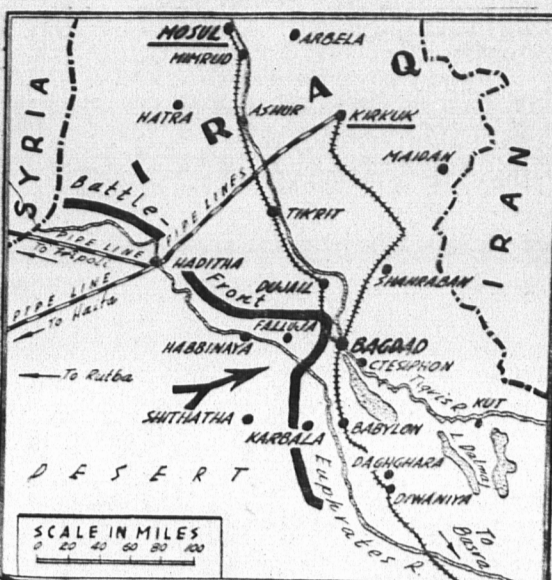
The military situation in Iraq has taken a turn for the better, and not too soon. The Germans and Italians contemplate moving in that direction the moment the British and Greek resistance is at an end in Crete. The stubborn defence of the garrison in Crete against odds that have become overwhelming, commands the utmost admiration.

The Iraqi usurper and his ministers and the diplomatic representatives of Germany and Italy have fled to the border of Iran across which they are expected to pass. A committee of four, headed by the mayor of Baghdad, has asked for an armistice, which has been granted. Prince Abdal Ilah, the regent who was overthrown by the usurper, and his premier, Nuri Said, were in the environs of Bagdad when last reported it is probable that they have re-established their government. They may be able to command the support of the Iraqi army from this time forward, if not too dependently.