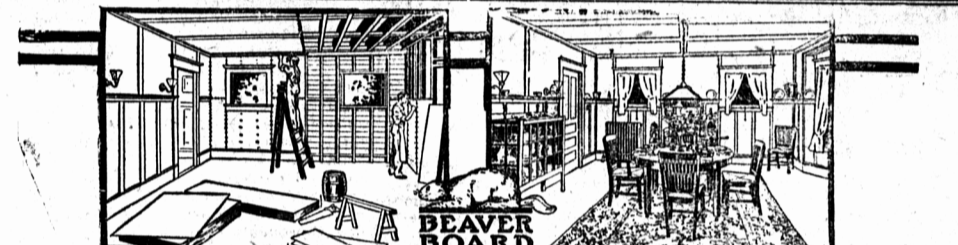
This shows a new room with the BEAVER BOARD being nailed to the studs. The work is easily and rapidly done, without the litter and confusion of lath and plaster.

HARRISBURG, April 23.—The Pennsylvania Senate has voted 26 to 22 for Woman suffrage in that state.