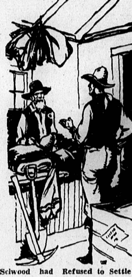
Selwood had Refused to Settle His Claim

Of course, any good impression that Selwood might have made must fade before all of this. Moreover, Selwood was much in disfavor with those about her. She was out of humor with him herself because he stubbornly insisted that her father was denying his own goods, and Selwood had refused to settle his claim unless her father would first accept the Atkins boots.