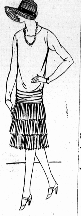
By Marie Belmont

THIS NAVY BLUE COSTUME IS MARKED BY STRIKING SIMPLICITY