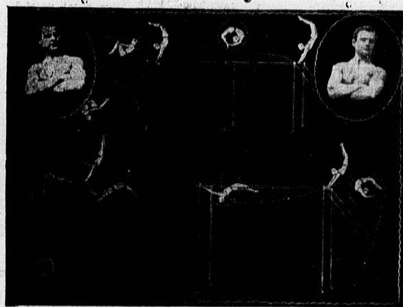
THE LARGARDS The Triple Horizontal Bar Acrobats

ALL THE BEST LIVE STOCK IN THE MARITIMES--ALL THE BEST RACE HORSES