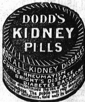
CURE FOR RHEUMATISM, BRIGHT'S DISEASE, DIABETES, GRAVEL, etc.

We greatly regret and cannot accept as final the action of the City Council at its recent meeting in refusing the proposed grant of $300 in aid of the Public Library. We believe the proposed grant to be in the best interests of the City and also in accord with the wishes of our citizens. It is moreover a necessity if the Library is to be maintained as a free institution, which is in every way desirable. We are informed and believe that without the smaller amount asked from the city a charge will have to be im-