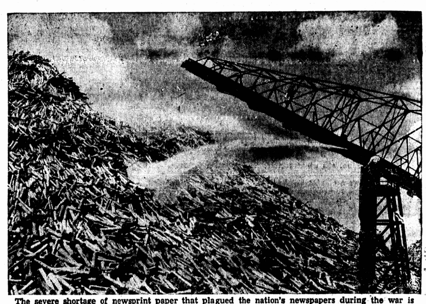
The severe shortage of newspaper paper that plagued the nation's newspapers during the war is still almost as bad as ever, but pulp mills are making frantic efforts to relieve the deficit. Typical of what's going on is the photo above, showing a huge stockpile of paper pulp logs at Hull in the Gatineau River district of Quebec, being wetted down to lessen fire hazard. Before the war, three out of every eight newspapers in the world were printed on Canadian paper.

In its homes, hospitals and hostels for men, women and children who have fallen prey to mischance or human frailty, The Salvation Army brings new hope to the despairing and restores shattered lives. Your dollars are needed to make this work possible. Give generously. Space donated by S. A. McDONALD HOME FRONT APPEAL