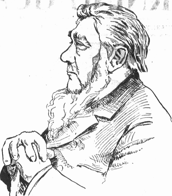
PAUL KRUGER Late President of the Transvaal.

There is always something new in the way of medical treatment, and you are constantly invited to try new fangled, unproven remedies. Let others experiment and so risk health and lose time. Dr. Chase's Kidney Liver Pills have been tried in the crucible of time, won the approval of public opinion and demonstrated their right to a place in every home as family medicine.