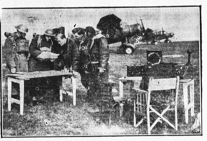
In addition to the Canadian airmen already with the fighter and bomber commands in Britain the R.C.A.F. has now formed a complete Army Co-operation Squadron. This photo shows Canadian airmen discussing a problem of co-operation with Canadian pilots. A Captain, of Moose Jaw, Saskatchewan is briefing three Lysander pilots to do a job for the artillery. Portable wireless set, with operator at the controls, is seen alongside.