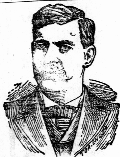
HON. NATHANIEL CLARKE WALLACE, M.P.

Hon. Clark Wallace's condition is somewhat improved and his physicians say his chances are now favorable.