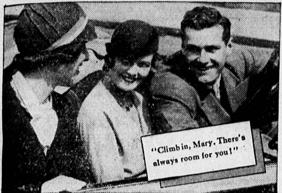
"Climb in, Mary. There's always room for you!"

The girl with clean, wholesome skin is always welcome. Men single her out for the charm of her natural loveliness.