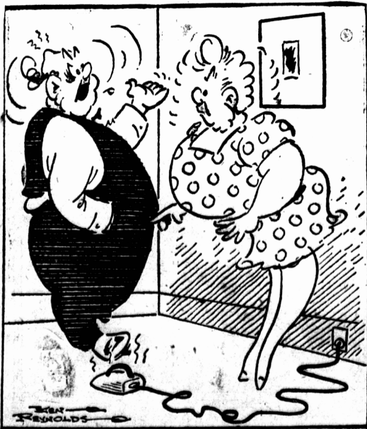
"When we got that iron with a Guardian Want Ad you promised not to throw it while it was plugged in!"