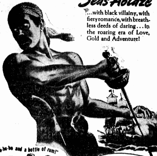
"It's a bottle of rum!"

...with black villainy, with fiery romance, with breathless deeds of daring... in the roaring era of Love, Gold and Adventure!