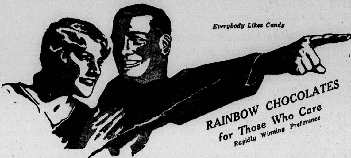
Everybody Likes Candy

PROVINCIAL DISTRIBUTORS R. T. Holman Ltd. Summerside