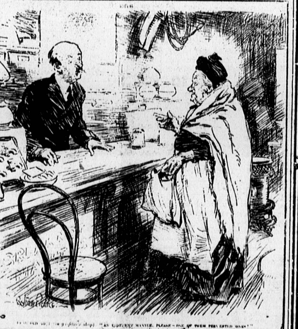
DEAR OLD SOUL (in gasfitter's shop): "An indecent mantle, please—one of them perverted one!" —The Humorist.