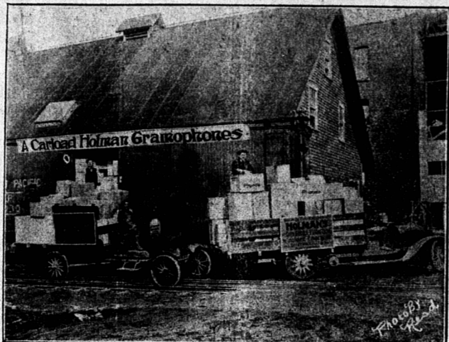
The above illustration shows R. T. Holman, Ltd., Summerside in the act of unloading a large C. P. R. carload of gramophones. Needless to say this is a record shipment for a P. E. Island firm; indeed few other firms besides Holman's in all Canada handle the same immense quantities of Gramophones. Besides the above, substantial shipments were received by express and a number of small shipments by freight. 2425-11-20ME11.