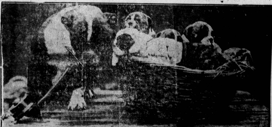
A litter of bulldog pups in Greenwich, near London, England, and their mother are keenly interested in "listening in" to radio, as this picture shows. The photographer caught them investigating the wonders of a loud speaker.