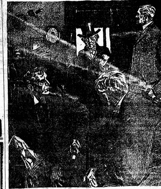
WE LOOKED UP TO FIND A QUEER LITTLE OLD MAN IN THE DOORWAY.