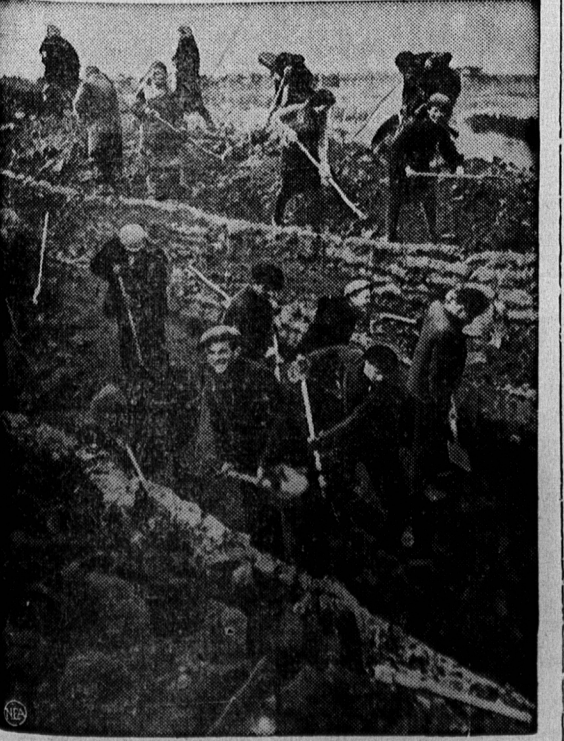
Leningrad's pick and shovel crew looks beamishly unblitzed as it trowls out tank traps for attacking Nazi panzer divisions. Picture radioc from Moscow.