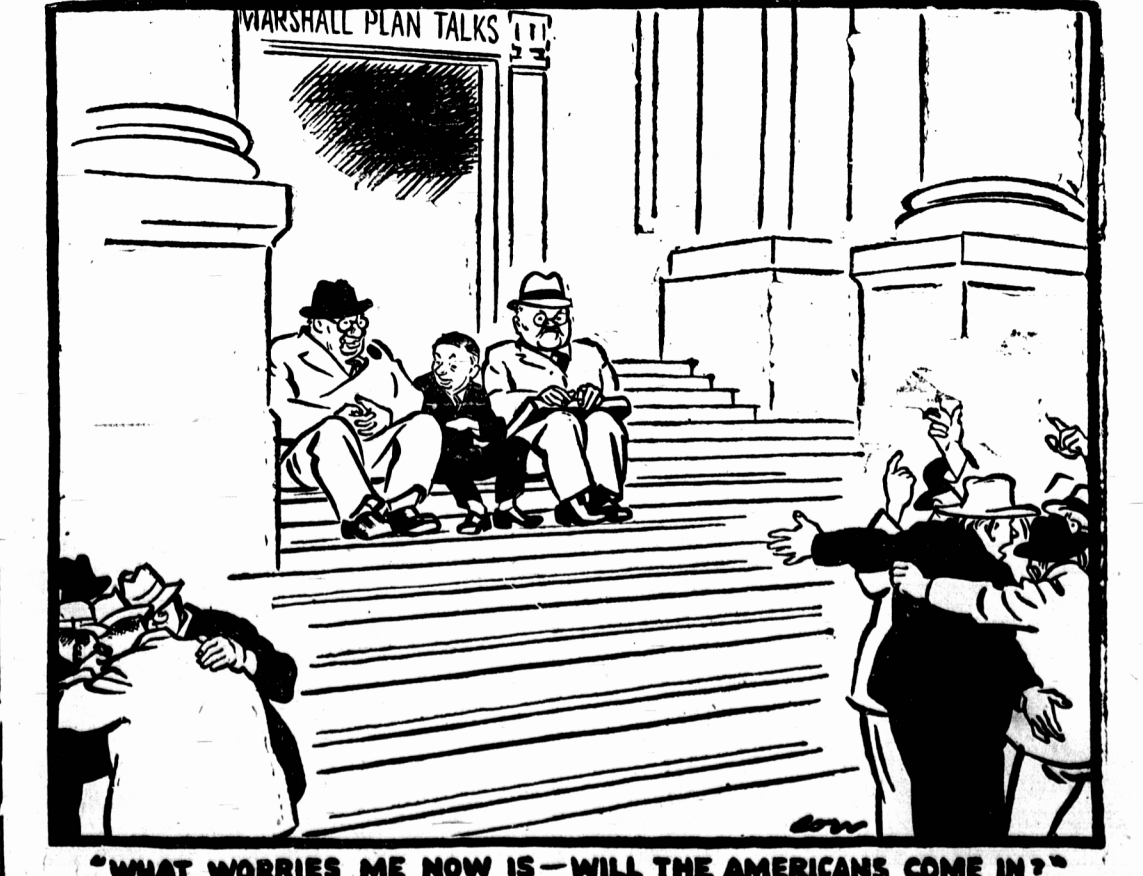
"WHAT WORRIES ME NOW IS—WILL THE AMERICANS COME IN?"