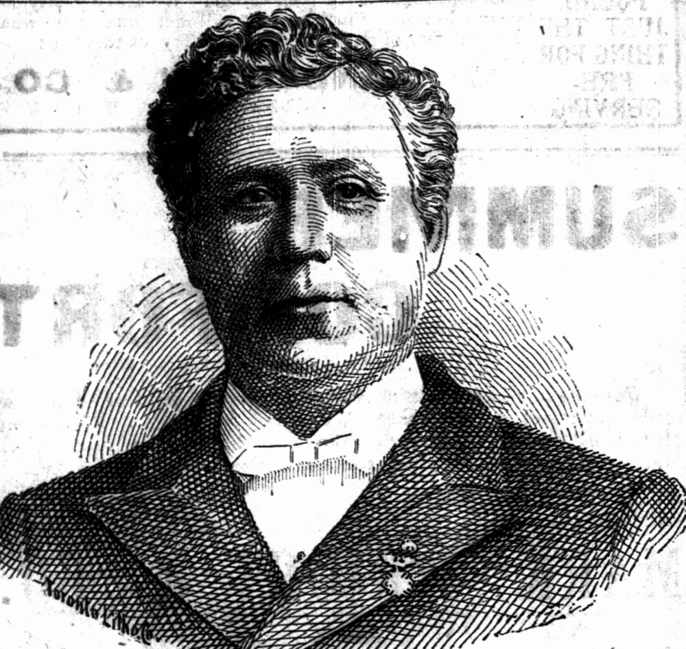
ORONHYATEKHA, SUPREME CHIEF RANGER.