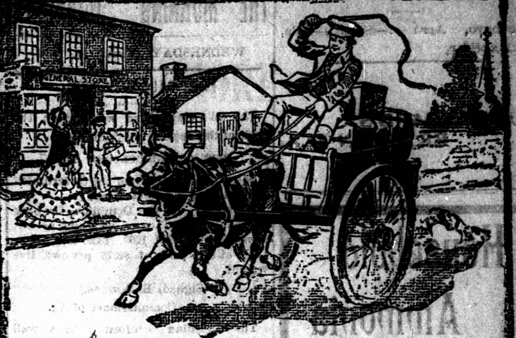
CHRISTIE'S 50 YEARS AGO.