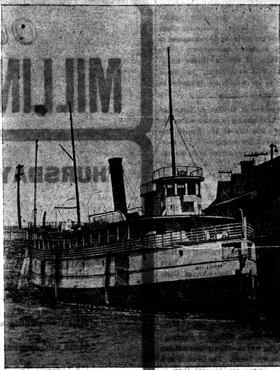
THE STEAMER CITY OF LONDON

Bicyclists and all athletes depend on BENTLEY'S LIME to keep their oiled timber and muscles in trim.