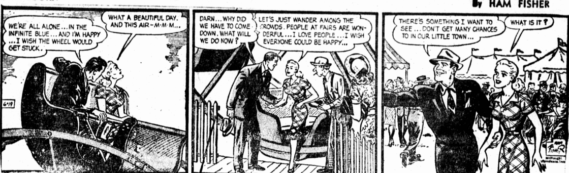
By HAM FISHER