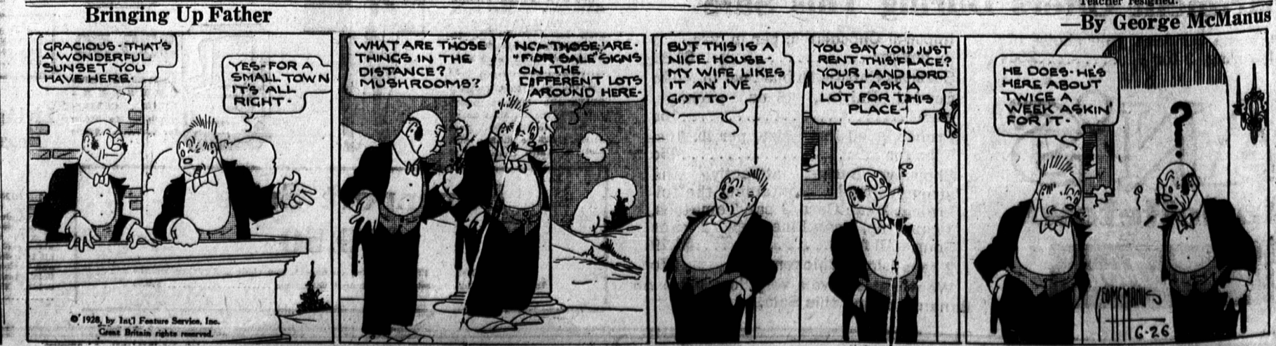
Bringing Up Father By George McManus