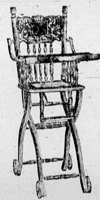
$1.00 to $4.75

Elegant hand drawn, and Battenberg linens. Ideal gifts to send to friends abroad—mailing costs but a trifle and the articles can't break in transit. These are real hand made goods such as every woman delights to possess.