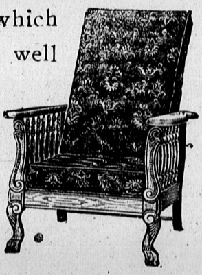
$5.00 to $20.00