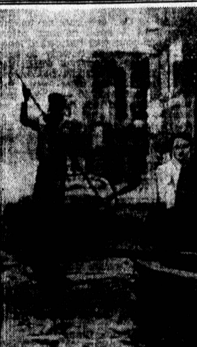
"VENICE," OHIO Flood waters starting at Pittsburgh, rolled angrily down the Ohio River with increasing force, inundating riverside towns along the way so that, as in the view of a Marietta, Ohio street, above, they looked more Venice, with its gondoliers. At Portsmouth, on the Kentucky border, the flood crest almost topped the city's 62-foot concrete dikes.

(By The Canadian Press) Jan. 9, 1918—British destroyer Racoon sank after striking rock off the Irish coast. Heavy artillery actions developed northeast of Ypres and south of the Scarpe River on the Western Front.