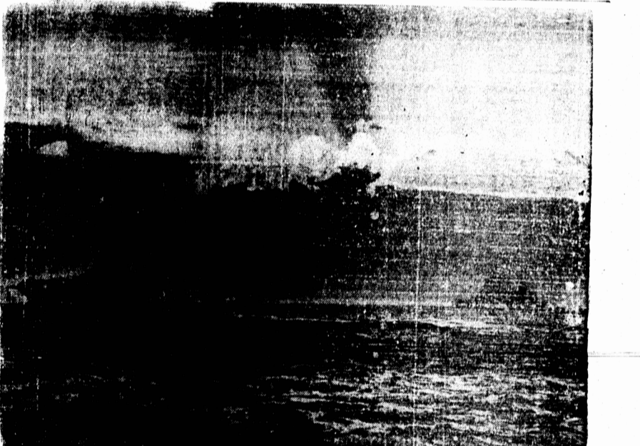
V-shaped glow in the sky hangs symbolically over a craft carrier and capital ship stand guard off allied gray Mediterranean where silhouetted British air positions on the African coast.

Castles are built on the sides of extinct volcanoes in Scotland.