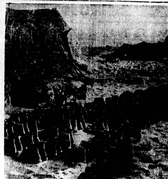
Shoes in the sand at a British outpost in Libya are of a special noiseless kind worn by night patrols penetrating enemy lines.