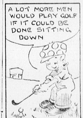
A LOT MORE MEN WOULD PLAY GOLF IF IT COULD BE DONE SITTING DOWN