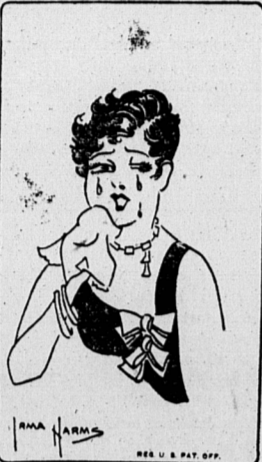
"When people cry over a screen play one knows it's a moving picture."