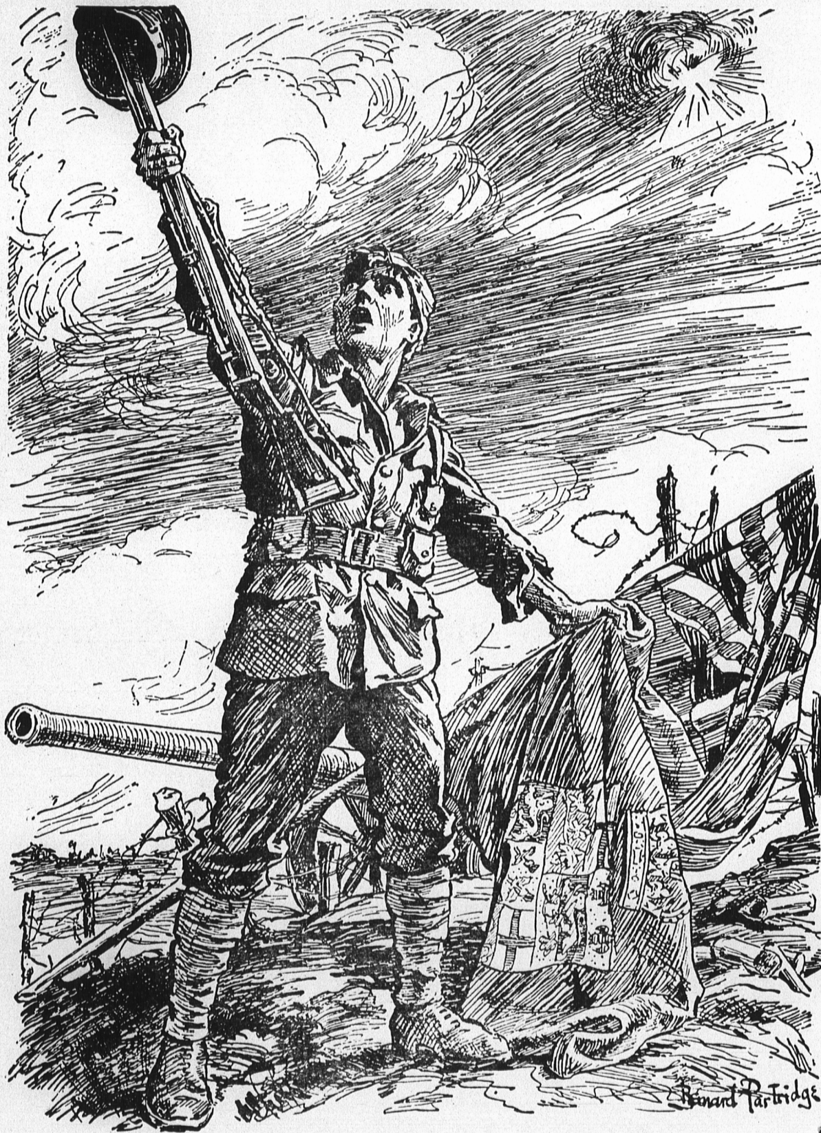
CANADA! Ypres, April 22-24, 1915

In this famous drawing from Punch, Sir Bernard Partridge commemorated for all time the heroic stand of Canada's First Division against poison gas and overwhelming odds. As our soldiers held the line then, so Canada must hold it now.