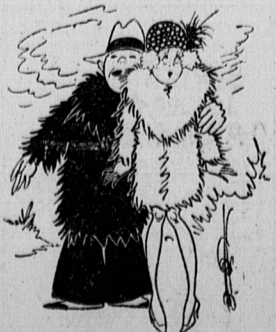
He: I'd go through anything for you. She: Idiots! You have nothing to go through.