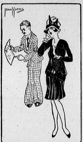
"Don't attribute it to modesty when your tailor refuses to take credit for your smart appearance."