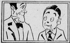
WHY SHE HAD NEVER SMOKED "And why is it your wife has never smoked?" "Because I have always expressed my entire willingness to have her do so."