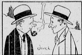
WHY THEY ARE "BLIND" "Why are some dates called 'blind'?" "From the liquor consumed on the occasions, no doubt."