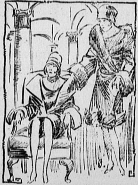
MEOW! MEOW! "I never like to talk about a person, but she gave me a recipe for a cake last week and I do believe she left out the main ingredient purposely."