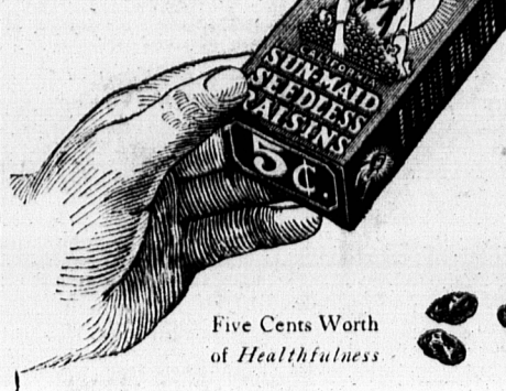
Five Cents Worth of Healthfulness