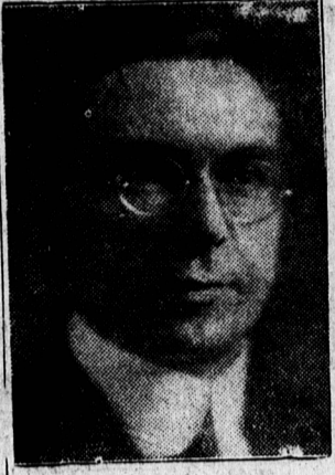
SIR RICHARD SQUIRES Formerly Premier of Newfoundland, whose administration will be the subject of an investigation by a royal commission just appointed.