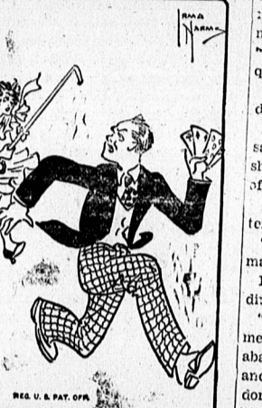
"A card player's poker face is the result of his pursuit."

FATAL LAPUS LINGUAE She gave me a dance; when the time arrived Somehow I lost my head, Instead of "This is mine, I think," "Will you be mine?" I said.