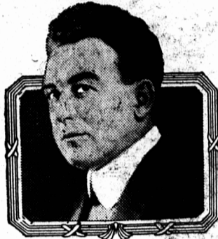
WILLIAM DUNCAN VITAGRAPH