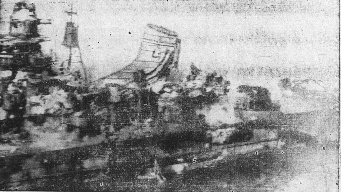
After she had been blasted with torpedoes and bombs, during the great Midway Island battle, a Navy flying photographer skimmed alongside and took this photo of the hulk of a Jap Mogami-class heavy cruiser. At left is her battered bridge, behind it the remains of her funnels.