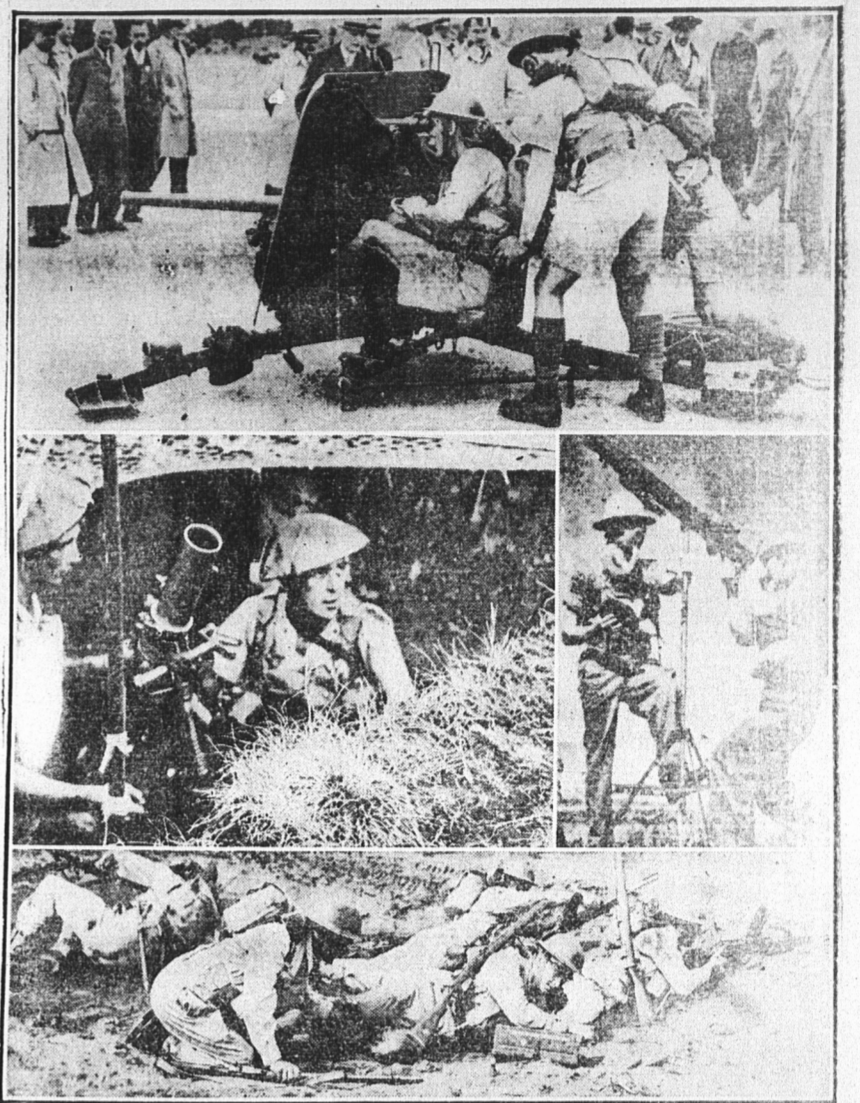
The Canadian Army has had long hard months of training and stands ready for what may come. Above are illustrations showing various types of weapons and the methods of using them. AT TOP is shown an anti-tank gun. (This picture was taken when a group of Canadian editors viewed the proceedings.) CENTRE, a machine gun is being used against air craft; and ON THE LEFT is a mortar. BELOW a Bren gun section is taking up position in the open.