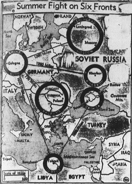
Summer finds the war in Europe and Africa expanding its scope of action, sweeping into the six arenas of conflict shown on map. Massed British bombers are raiding the Rhine-Ruhr and other industrial areas of western Germany. In the Balkans, activity is both in the air—with U. S. bombers raiding Rumania—and "underground." On the four other fronts, active axis-allied fighting goes on. Distances are from the centers of action in each circle. Size of rings does not indicate intensity of conflict.