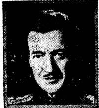
DAVID NIVEN as "ROLLO" ...no one could resist his charm, yet the thing he wanted most—he lost

JUST ABOUT THE MOST WONDERFUL LOVE STORY EVER FILMED!