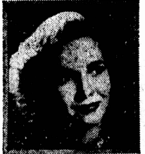
TERESA WRIGHT as "LARA" ...there was nothing else in life for her but loving and being loved.