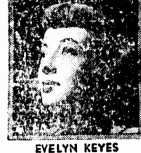
EVELYN KEYES as "GRIZEL" ...afraid of life, afraid of love, but somehow she could not turn away.