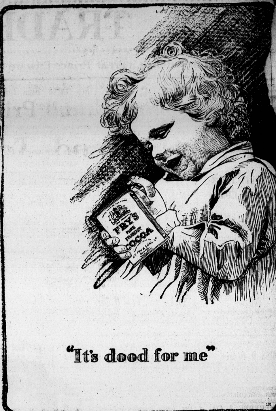
"It's dood for me"