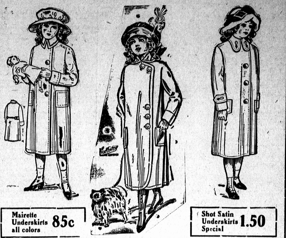
Mairette Underskirts 85c all colors