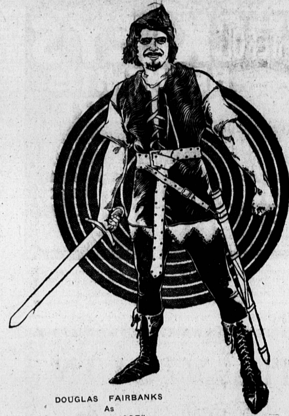
DOUGLAS FAIRBANKS As "ROBIN HOOD"

TOMORROW—THURSDAY SPECIAL PRICES Matinee, Adults 37c. Children 26c. Evening, Orchestra 52c. Balcony 37c. Children 26c. Matinee at 2.30. Night 8.15