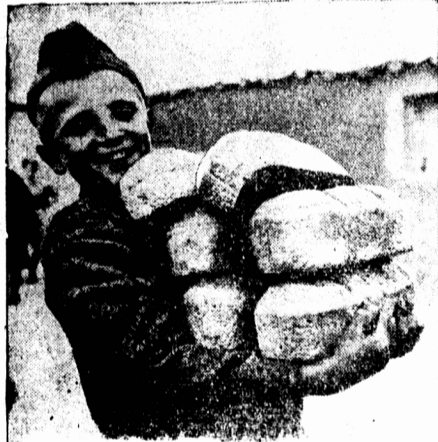
In distant Asia there are evidences of American aid on every hand. A Russian pilot approaches his newly arrived U.S.-built plane. At an evacuation camp in Iran a smiling Polish boy holds an armload of ready-to-fly bread baked from flour supplied by the American Red Cross. At a Soviet

W. K. ROGERS AGENCIES, LTD., Currie Building, Charlottetown.