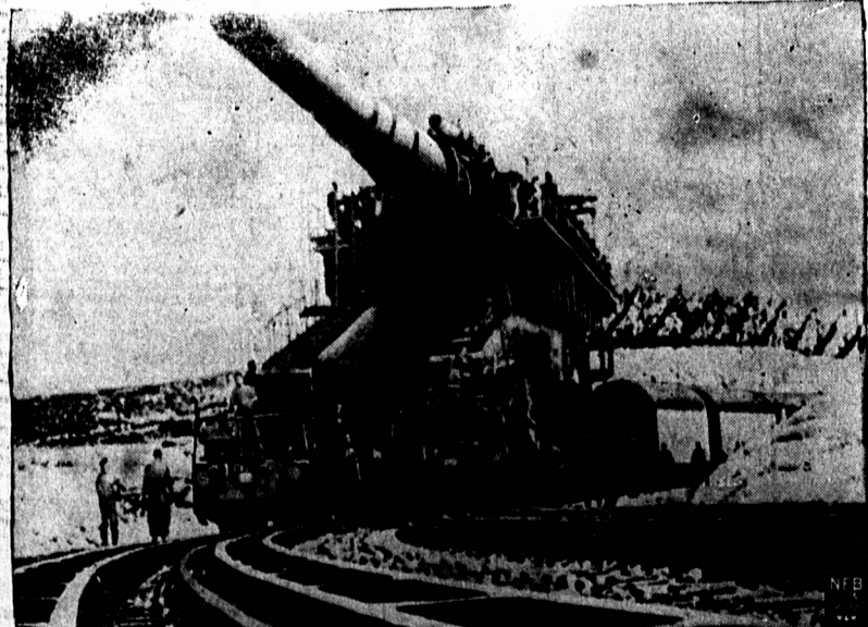
HEAVYWEIGHT GUARDS FRENCH COAST As the zero hour draws near for a United Nations invasion of Europe, the men who plan it are under no delusion concerning the difficulties which must be overcome by our fighting men. Facing the English Channel along the coast of France the Nazis have built one of the most powerful systems of fortifications in the world—the Scheldt Line. It is be-