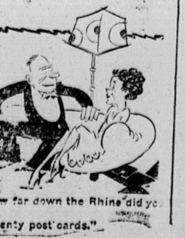
"How far down the Rhine did ye." "Twenty post cards."

"My brother made ugly faces at your brother yesterday and he didn't dare to fight. He pretended he didn't notice 'em." "He didn't neither. He thought they wuz natural."