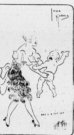
"The infant who swallows a coin may be only playing safe."