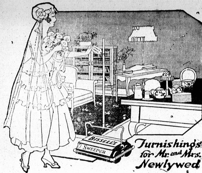
Turnishings for Mr. and Mrs. Newlywed

Everything she Needs to Furnish the Home may be Selected Here