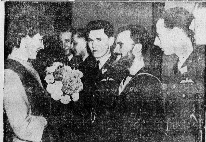
Her Royal Highness the Duchess of Kent is seen chatting with a bearded bluejacket from the Argentine and airmen from Australia and New Zealand during a visit to the London headquarters of the Overseas League. The Duchess met members of the fighting forces from all part of the British Empire when she paid her informal call.

medicine is often prescribed for children, and accurate dosing of medicine is then possible. Yolks of eggs are much less likely to break if cold. Remember this in separating eggs, attending to it as soon as you take them from the refrigerator. Celery leaves may be dried and stored in a covered jar. A few of those dried leaves added to soups and stews give an excellent flavor. Sprigging of fruits, pickles, relishes, etc., is made easier by putting the spices in a tea ball. It can be removed from the hot syrup at any time without trouble. Lower biscuits can be split, buttered and toasted in a slow oven, then served with a brown meat stew over them. If you have a wooden bowl handy, use it when washing silver, as silver has a tendency to get scratched on the bottom of a metal or enamel container.