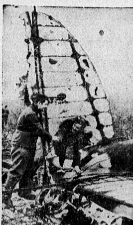
USE NAZI PARTS

GIRLS OVER 20 OR WOMEN OF £100 appearance wanted to distribute well known line of home necessities. Good opportunity to create independent earnings. Apply Rawleigh's, Dept. ML-470-141-K., Montreal, Canada.