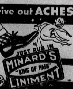
MINARD'S LINIMENT "KING OF PAIN"

With the increased demand for Pork Products, we require more Hogs than in former years. The intelligent Island farmer understands that PROMPT killing of Hogs after leaving his pens, is to his advantage, and where he can bring or send them to us, he receives this service as well as avoiding double handling and long delays in transit with consequent loss in shrinkage, etc. SEND OR BRING US YOUR HOGS IT IS TO YOUR ADVANTAGE Davis & Fraser