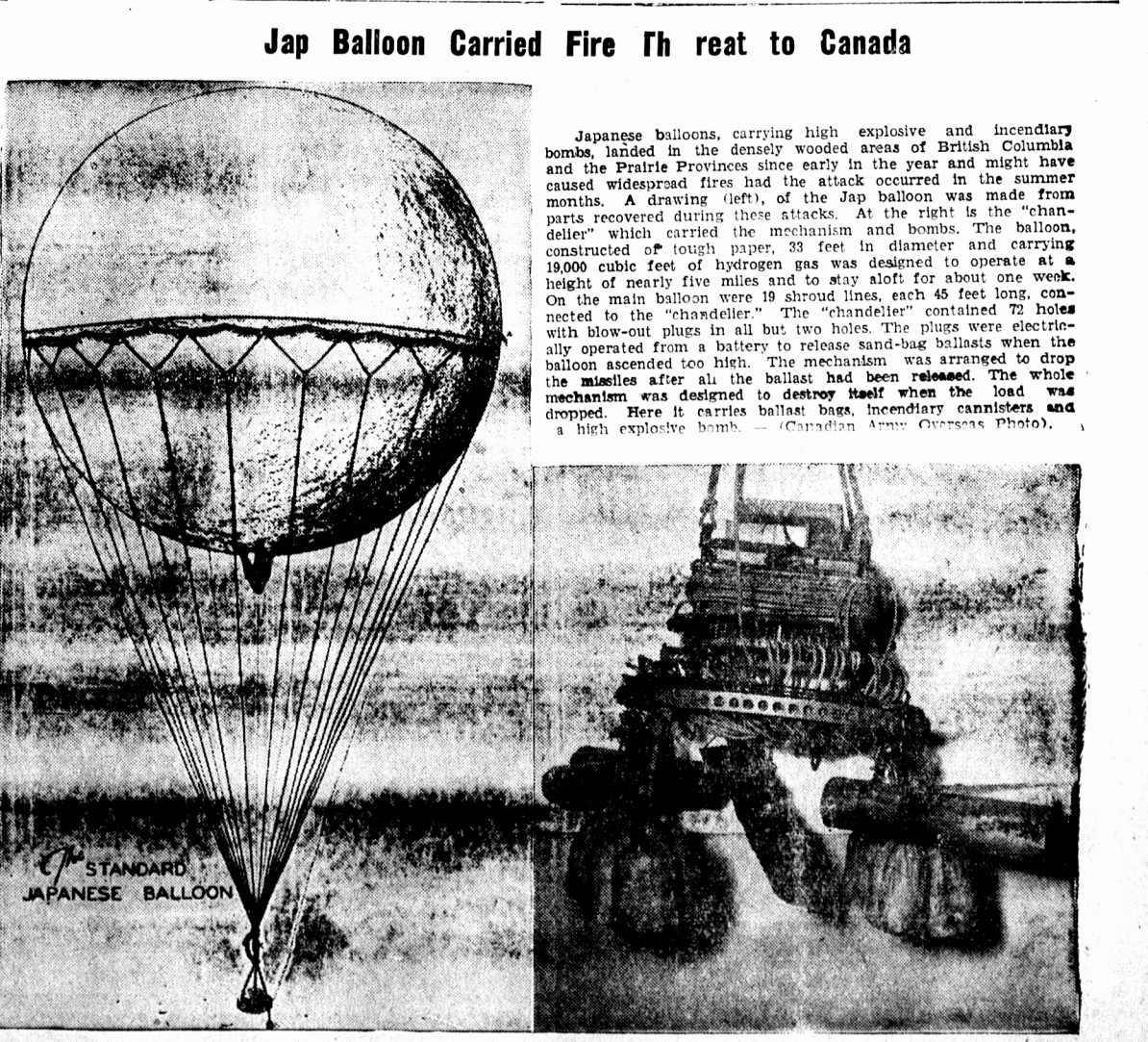
Jap Balloon Carried Fire Threat to Canada