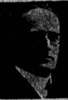
By James W. Barlow, M.D. MORE ABOUT BACKACHE

Butter from New Zealand is not the only farm product from that dominion that is competing for the Canadian market. A message from Vancouver states 130 tons of New Zealand onions have arrived at that port.