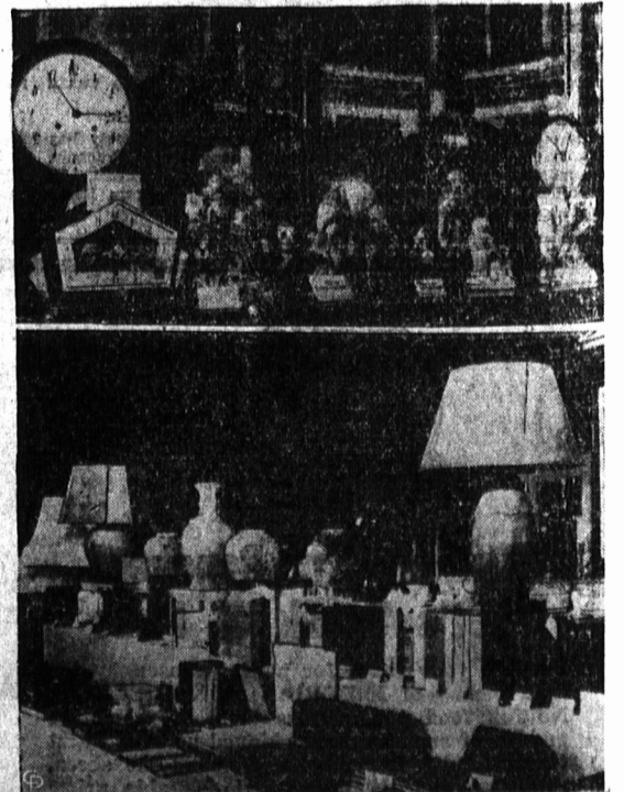
In the Duke and Duchess of Kent should desire to know the time of day they may look at any of these six rare clocks (UPPER photo) or some of the others, too innumerable to squeeze within the scope of this camera if they desire some light in their new home they may switch on any of the many lamps shown in the LOWER photo. Rare editions of famous books are also on the table. Everything shown is just a small portion of the deluge of gifts that were given the duke and the duchess before their colorful marriage in Westminster Abbey. A king's ransom