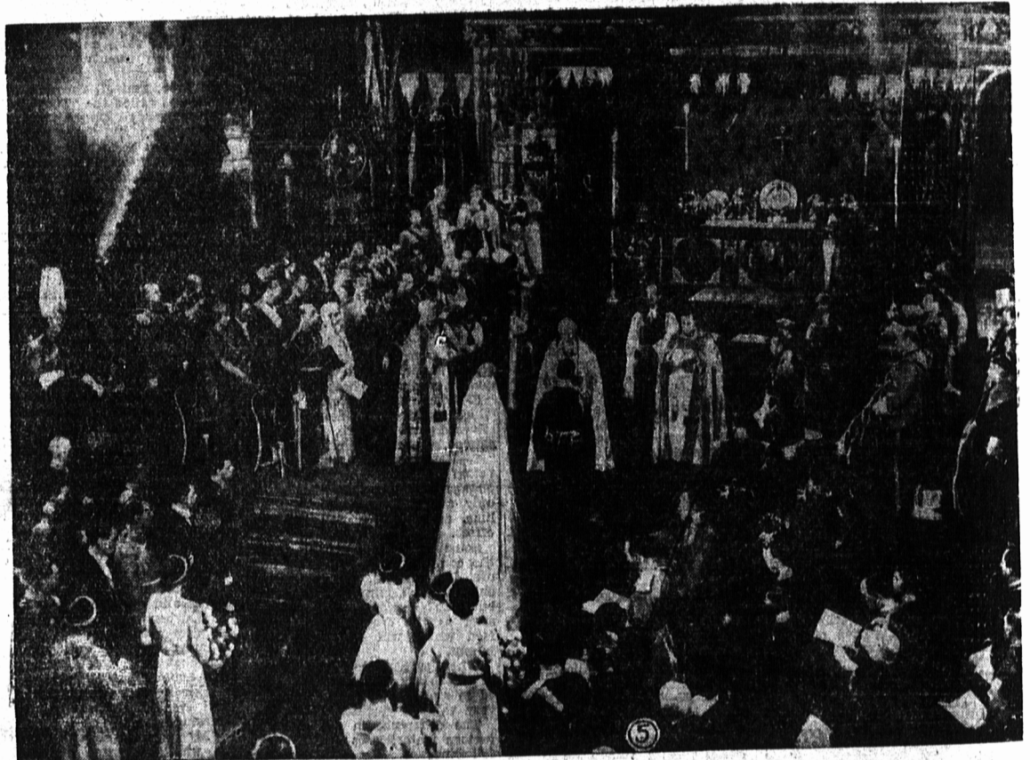
Scenes of unparalleled pomp and splendor and the amassing of enormous crowds to wish the young couple well featured the wedding of London of Prince George and Princess Marina. These pictures were rushed to Canada by water, rail and air from the scene of the wedding. They show, (1) the bridal couple on the platform of Paddington station before they left for their honeymoon in Hilly Hall; (2) a vast multitude there as the coach bearing the Duke of Kent and his bride enters the gates of historic Buckingham Palace; (3) the ceremony in the Abbey. The bride and groom stand at the altar. The group seated at the left includes the King, the Queen, Prince and Princess Arthur of Connaught, the Duchess of York, Princess Margaret Rose (seen seated on floor), Lord Harewood and the Earl of Athlone; (4) the royal bridal party photographed in Buckingham Palace after ceremony, left to right, Princess Katherine, Lady Iris Mountbatten, the Prince of Wales, Princess Olga of Greece, the Princess Marina, Prince George, Grand Duchess Kera, the Duke of York, Princess Irene and Princess Julianna. Seated: Lady Mary Cambridge and Princess Elizabeth; (5) another scene of the ceremony in the Abbey, as the Archbishop of Canterbury joins the two in matrimony.