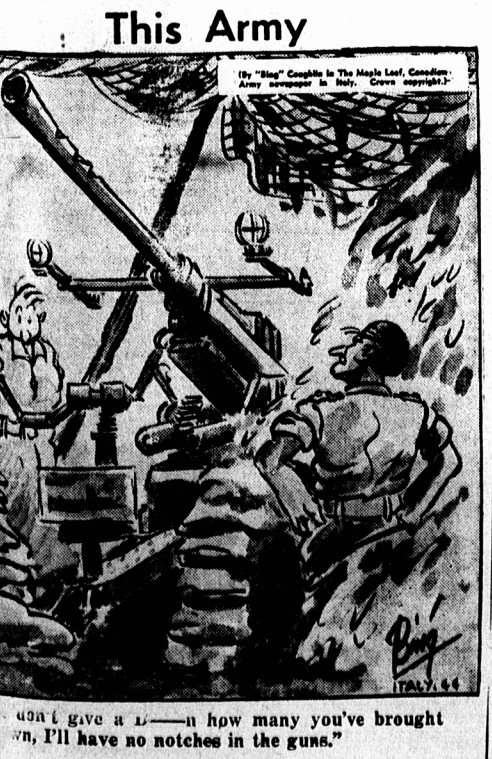
don't give a D—n how many you've brought in, I'll have no notches in the guns.