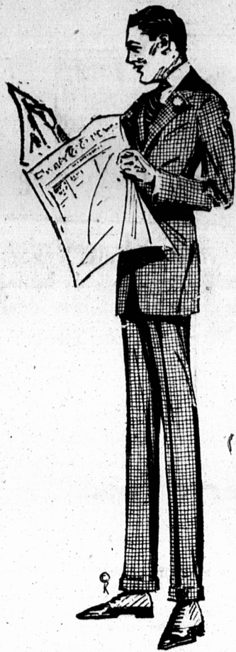
Men's Soft Hats

From the best makers: our stock of men's Soft Hats comprises the very latest in patterns and shapes, the shapes are unusually smart, the color range comprises brown, green, grey and black, these hats are manufactured by such celebrated makers as Wolthausen, Borsalino, Stetson and others.