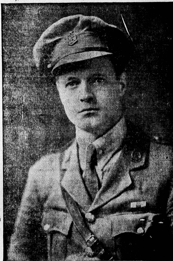
HON. DR. R. J. MANION, M. C. Leader National Government Party